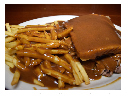
Bert's Wooden Indian's signiture dish: The Hot Roast Beef Toss-Up.

ert's Wooden Indian has had a reputation of taking rudimentary foods and sparking them into some of the best food in town!